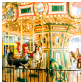
Exhibit Tip: A caregiver may stand with a child for free.

A longstanding museum favorite, the Carousel allows guests to be whisked away on a whimsical ride. Tickets are $2 per child and are available for purchase at the Front Desk. Adults stand for free.